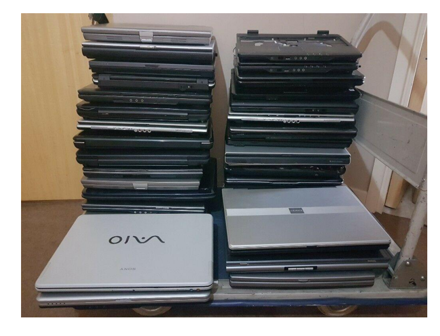
Donate lots of laptops please!