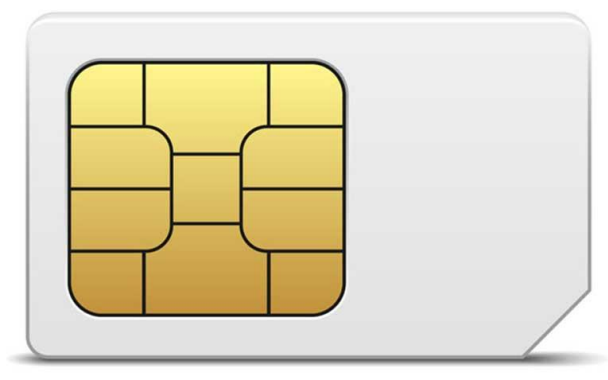
Short term Internet access